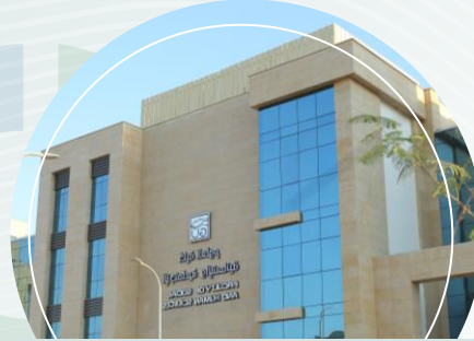
THE FACULTIES OF MEDICINE, HUMANITIES AND INFORMATION SCIENCES - GALALA UNIVERSITY