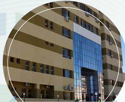
ASWAN GENERAL HOSPITAL