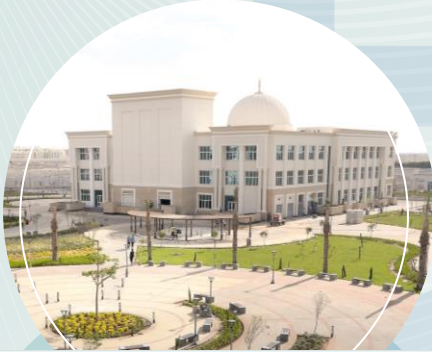
NEW MANSOURA UNIVERSITY - MANSOURA