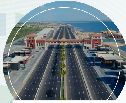
AL TA'MEER AXIS.