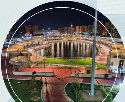
AL MAHMODIA AXIS.