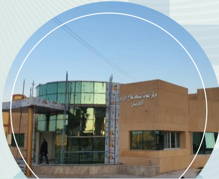
ARISH ONCOLOGY CENTER